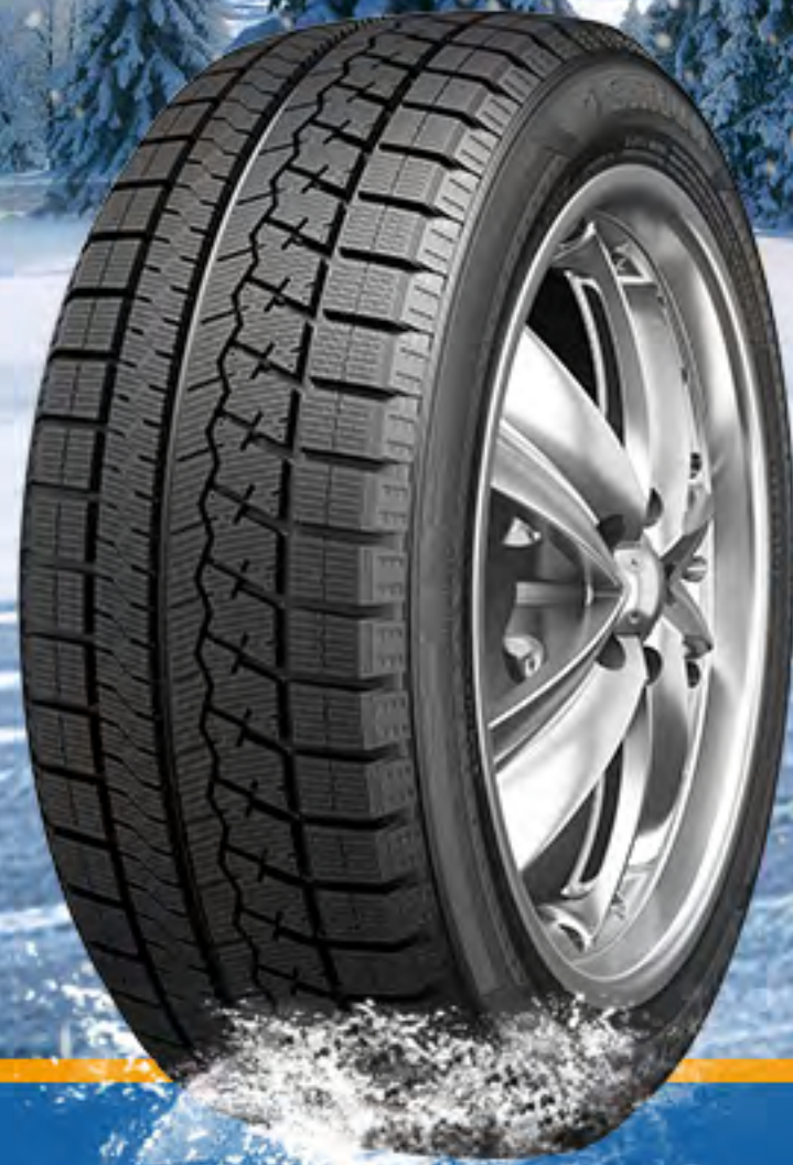
ICE BLAZER ARCTIC