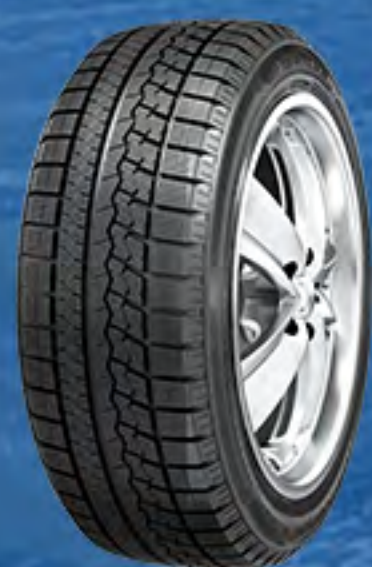
ICE BLAZER ARCTIC