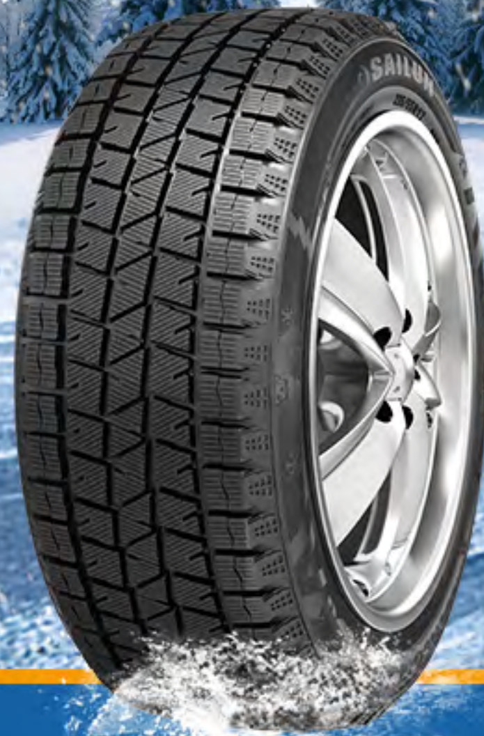
ICE BLAZER ARCTIC SUV