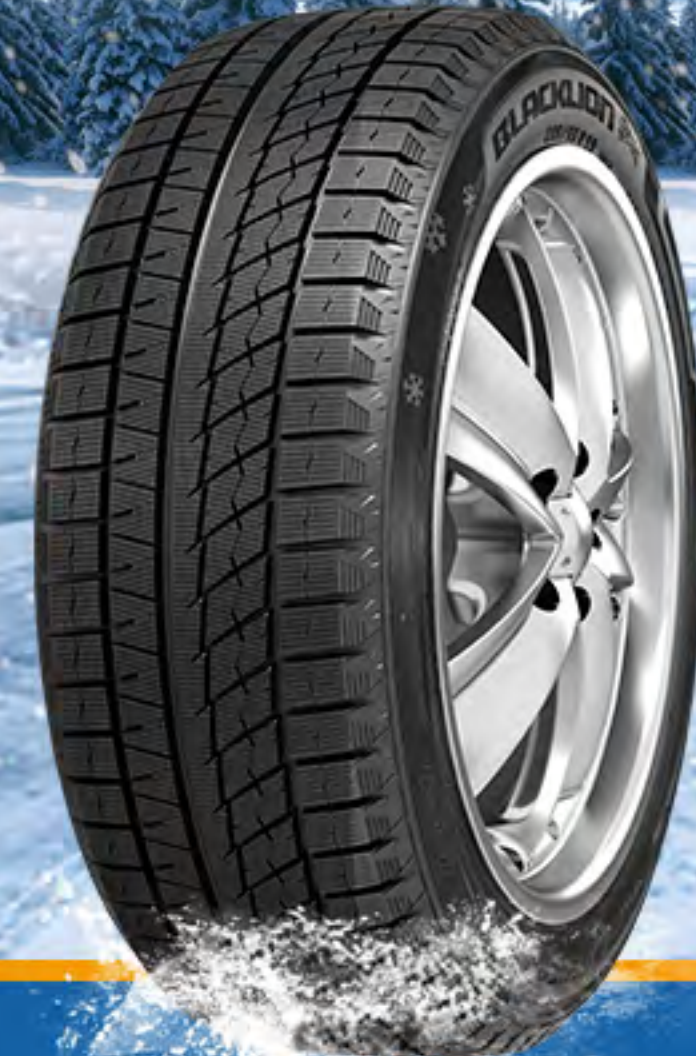
ICE BLAZER ARCTIC EVO